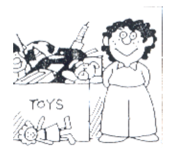
Tidy/clear away my toys.